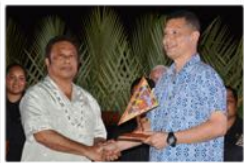
Visionary Award to President Remengesau