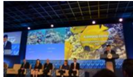
MAKING WAVES INTERNATIONALLY