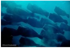
Bright Spots BUMPHEAD PARROT FISH SPAWNING AGGREGATIONS