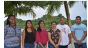
ON THE HORIZON SUMMER INTERNSHIP PROGRAM